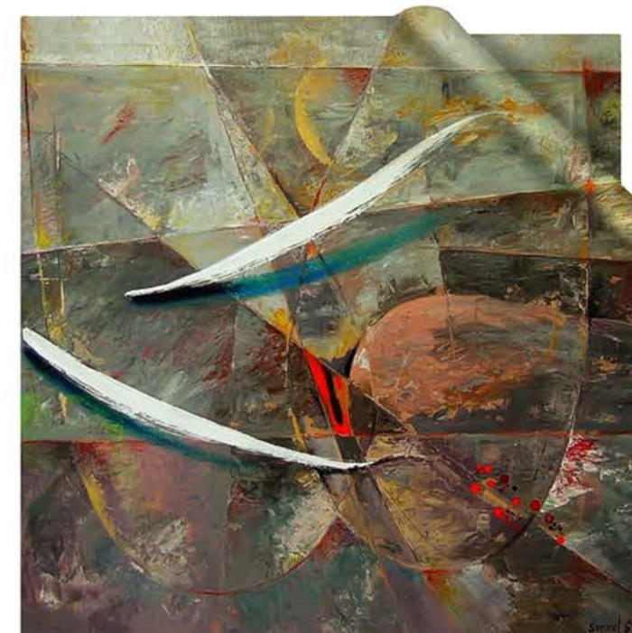
SVD / Scarves / Virgo SKU: 6008-2 $495.95