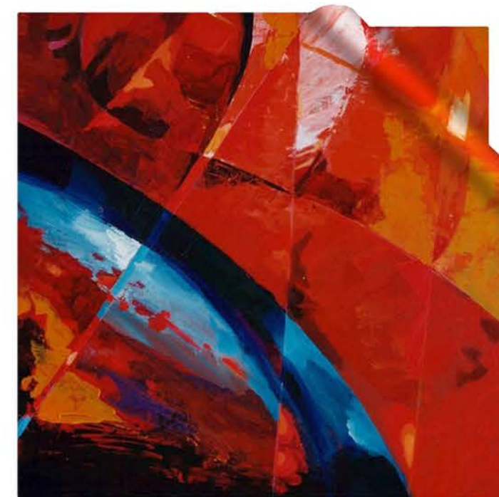
SVD / Scarves / Solaris SKU: 6008-3 $495.95